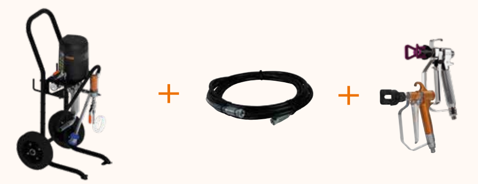
The Elcometer Typhoon pump can be wall or trolley mounted supplied with a fluid regulator and suction hose as standard. Hoppers can be purchased separately.

The Elcometer Typhoon Pump is available as a complete kit with the Sagola 500 PSAM Airless Spray Gun with reversible tip spray guard and product hose kit.